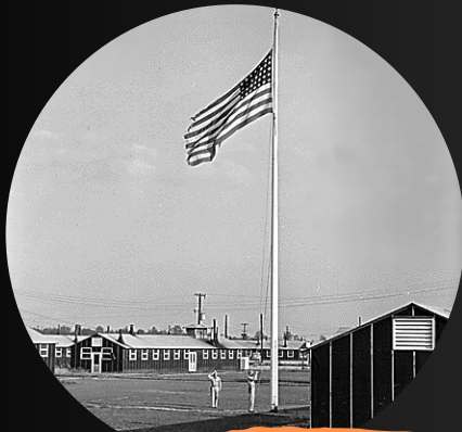
Jerome Relocation Center