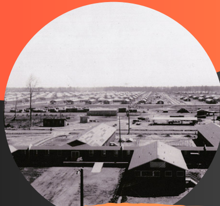
Rohwer Relocation Center